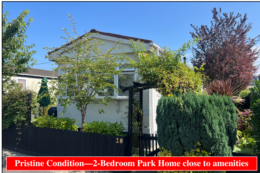
Pristine Condition—2-Bedroom Park Home close to amenities

28 Pilgrims Park, Southampton Road, Poulner, Ringwood. BH24 1TQ