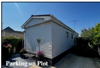
Parking on Plot